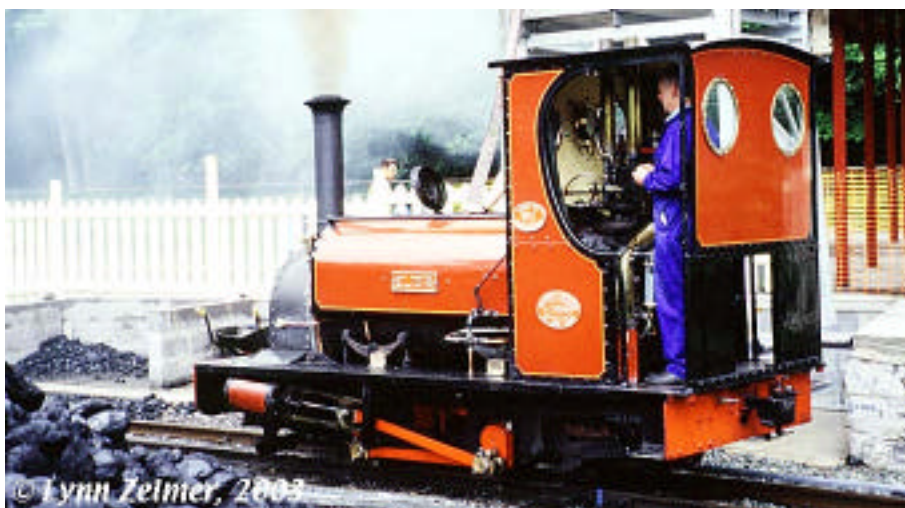
Llanberis Lake Railway's 0-4-0T Elidir near the Welsh Slate Museum, 27 June 2003.