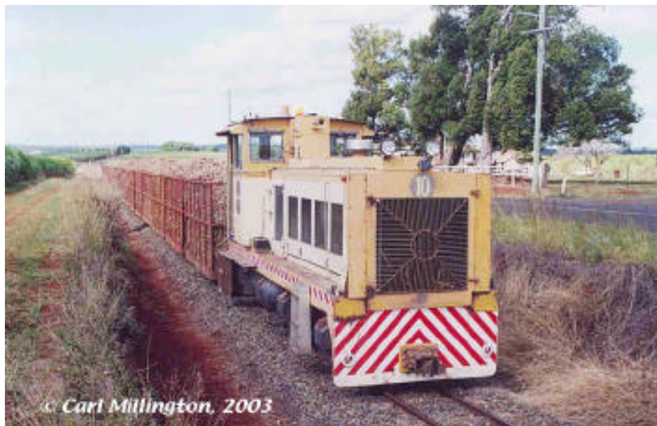
Isis Mill's Baldwin-built D10 on "The Hill" about to come out of Barnes's School line with fulls, 16 July 2003.