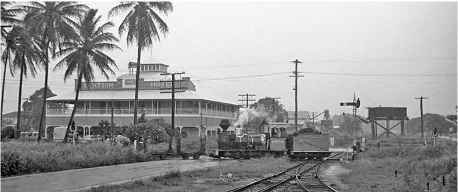
Victoria Mill Hudswell Clarke with a cane train crosses the QGR main line at Ingham station with the Station Hotel in the background, 1964.

[Editor's note: The double-sided colour brochure can also be downloaded for printing from the Society's home page.]