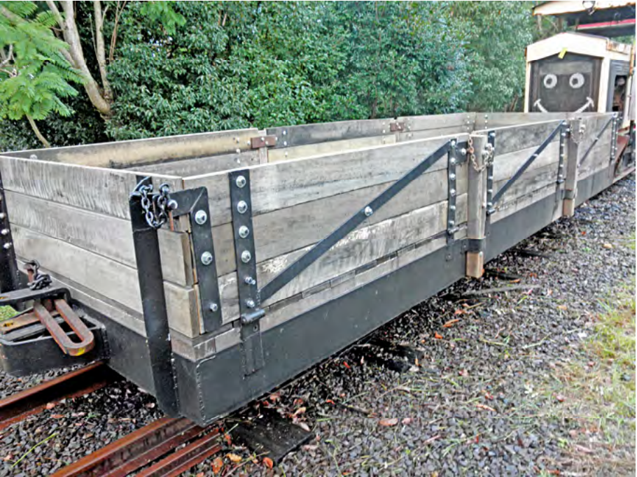
The Moreton Mill bogie open wagon, now restored and ready for accreditation.