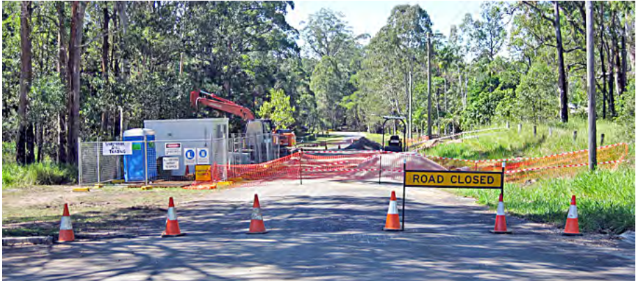
More photos (above and below) of the Peterson Road crossing construction, April 2012.