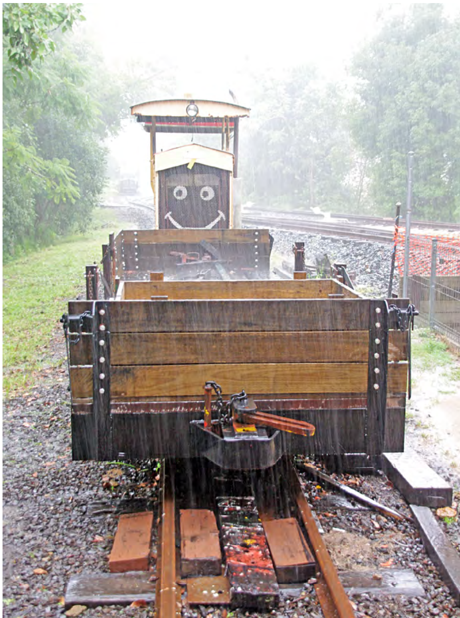
The newly restored Moreton Mill bogie open wagon during the same driving rainstorm that affected the 2012 AGM.