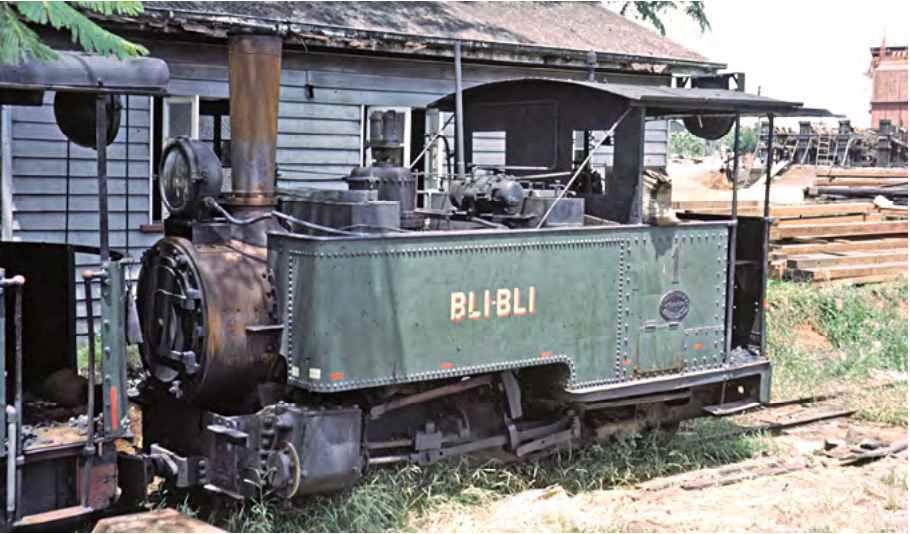
Moreton Central Sugar Mill's 'Bli-Bli' at Nambour, 20.2.65 (J Fowler, Leeds, 0-4-2T No 14418, 1918).