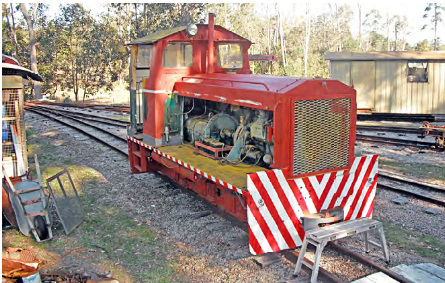
Netherdale being painted with undercoat.