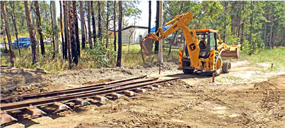
Moving pointwork at Peterson Road.

In “spare” moments, as well as work continuing on sorting, processing and stacking the Ingham concrete sleepers for future use, we are also gathering track bolt components for fish-plated joints. These preparations should minimise delays when we commence track laying using these materials at Peterson Road.