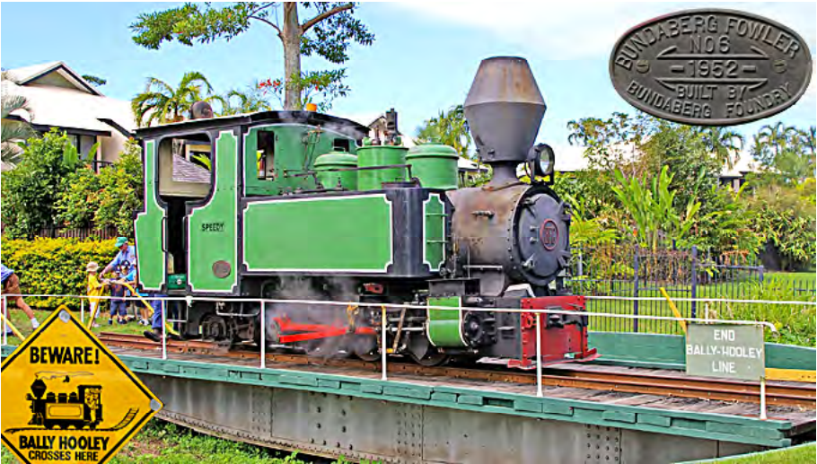
One of BFC5's 'batch mates', Bally Hooley's 'Speedy' (BFC 6, 1952) on their St Crispin's (ex-QR 40') Turntable. 30 July 2006.

There are no new sales items to report this issue.