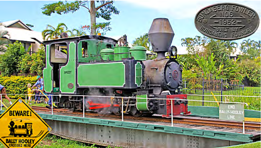
One of BFC5's 'batch mates', Bally Hooley's 'Speedy' (BFC 6, 1952) on their St Crispin's (ex-QR 40') Turntable. 30 July 2006.

There are no new sales items to report this issue.