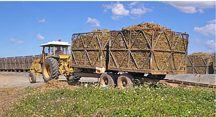
And a reminder that cane had to be transported from the field to a rail pickup point, Farleigh Mill area, 19 August 2006.