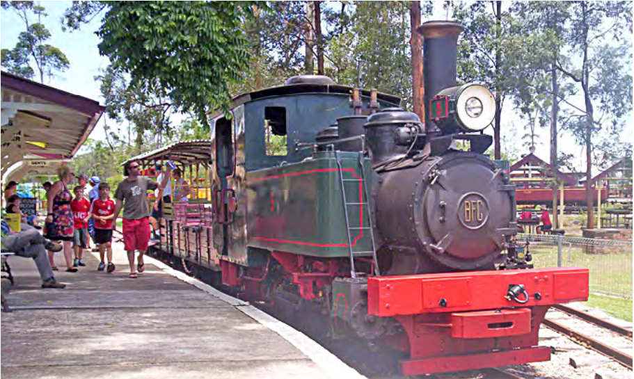
Bundy #5 at the Woodford station platform, likely on 16 November 2008.