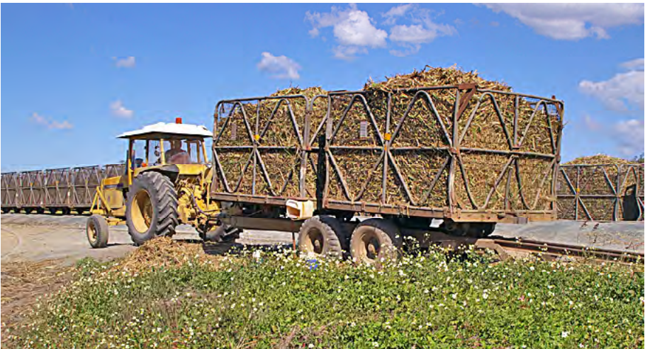
And a reminder that cane had to be transported from the field to a rail pickup point, Farleigh Mill area, 19 August 2006.