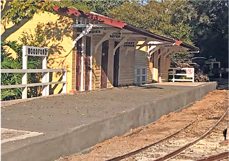
Woodford Station platform upgrade, 19 July 2018.