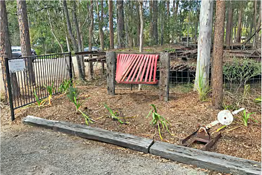
Peterson Road platform upgrade, 18 August 2018 (above and below).