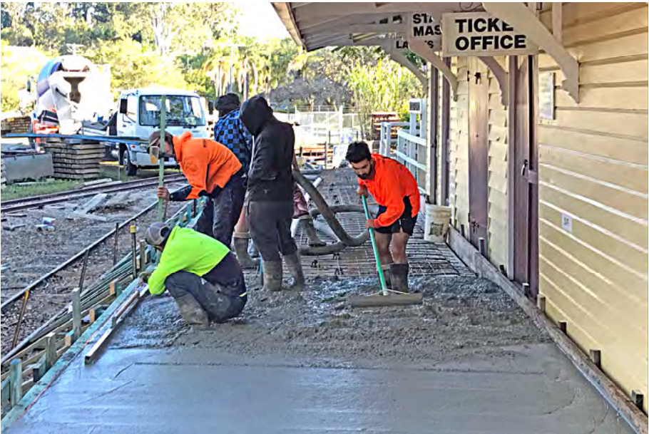
Woodford Station platform upgrade 19 July (above) and 22 July 2018 (below).