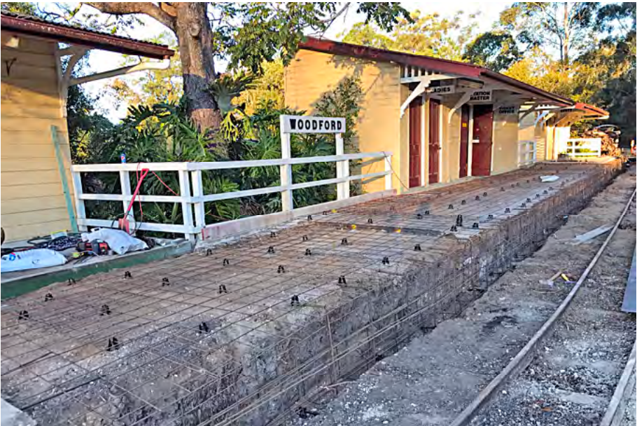
Woodford Station platform upgrade 18 July 2018.