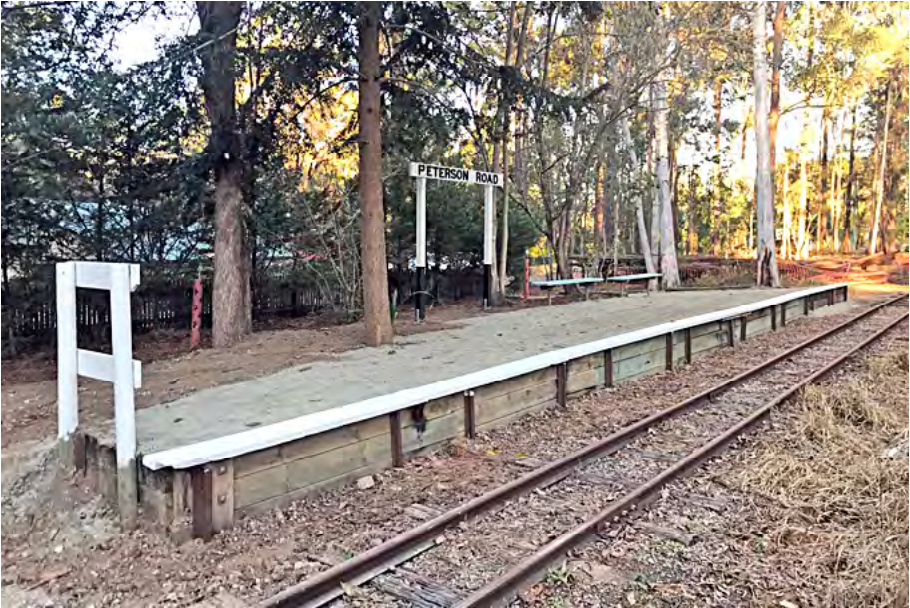
Peterson Road platform upgrade, 20 July (above) and 4 August 2018 (below).