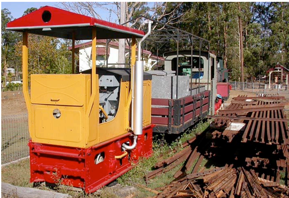
Recently restored (and repainted) Malcolm Moore loco sitting beside a pile of 'new' rail ex-Moreton Mill.