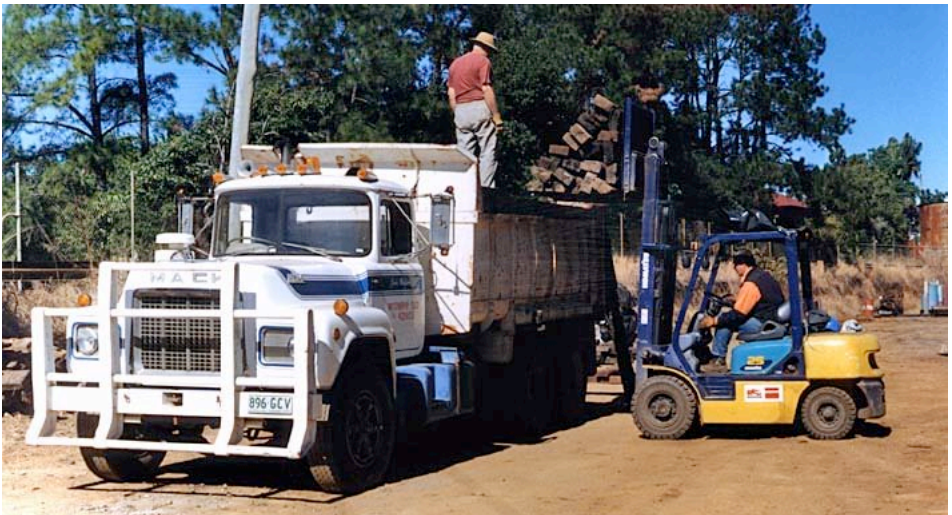
Moreton Mill sleepers for transport to Woodford.

Track Materials: The opportunity came to retrieve sleepers from the full yard at Nambour Mill. We had to sort through a couple of thousand sleepers to reclaim around 200 reusable sleepers. Due to unforeseen circumstances, the transport arrangements we made for the day didn't work out as planned. Fortunately, Jack Walden of Woombye left his tip truck for us to load and later delivered the sleepers to Woodford. These sleepers are now stockpiled at Woodford and were used for the repairs on 14 th August 2004