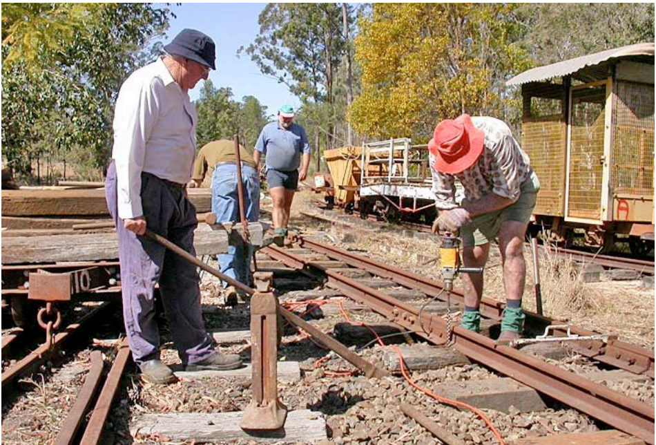
Replacing sleepers during the trackwork party, 14 August 2004, with the ex-Gooni Mill navy wagons in the background.