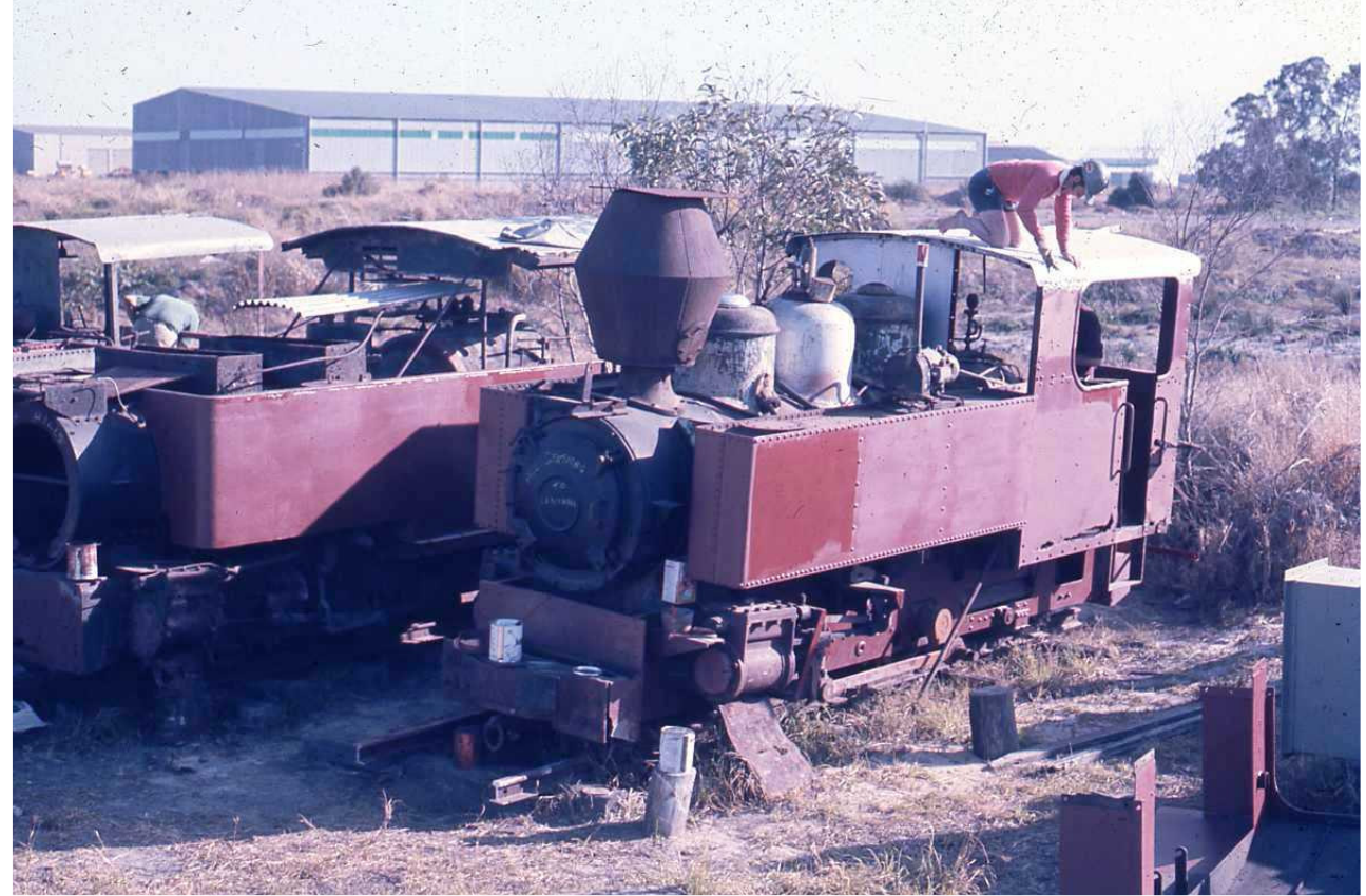
The reason ANGRMS needed a permanent home: This is a scene at Aitkin Transport's Readymix Yard at Eagle Farm. These locos had to be shifted to Queensland Transport Terminal at Rocklea when Aitkin's decided to sell the property.

It was a constant issue regarding secure storage and we are grateful that we never had to pay any lease fees.