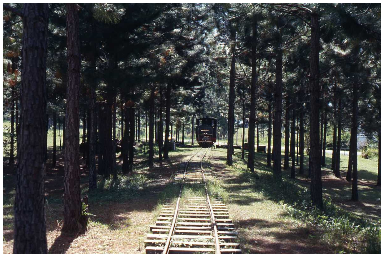
Amongst a forest of pine trees the Bundy Fowler sits quietly at the end of track at Margaret St, note the lightly laid track that was used at this time.