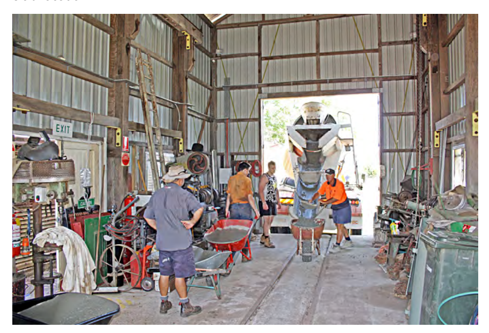
Wheel barrowing 5 cubic metres of concrete from the far side of the loco shed to the pit site.

After months of preparations and delays and frustrations caused by rain, the foundations and floor slab for the elevated service track was completed on Saturday 12th November 2011. In the weeks before the concrete pour, a temporary bed of sleepers had been laid so that the concrete truck could drive through the workshop to reach the location of the concrete pour. The original plan was to use two loads in a large "mini-mix" truck. However, on the morning of the concrete pour, it appears that there had been a "miscommunication" with the concrete plant and they had no record of our order! They could supply the concrete as required but only in a large truck that wouldn't fit through the workshop. Rather than postpone the concrete pour, it was all hands to the job so that 5m3 – a full truck load – of concrete could be wheel barrowed from the truck, through the workshop to the floor slab location.