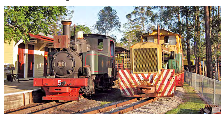
BFC 5 (Bundy) and the Jenbach, both products of Bundaberg Foundry, on 12 November 2011 when the Jenbach was being tested for use while #5 is undergoing maintenance.

As mentioned in the Operations report, the decision was made to withdraw our steam locomotive "Bundy" from service after the last public running day of 2011. While the boiler is retubed and inspected, we will not be shutting down and will continue to still operate on out normal public running days using one of our heritage diesels. This will mean we will need to put that bit extra into our marketing.