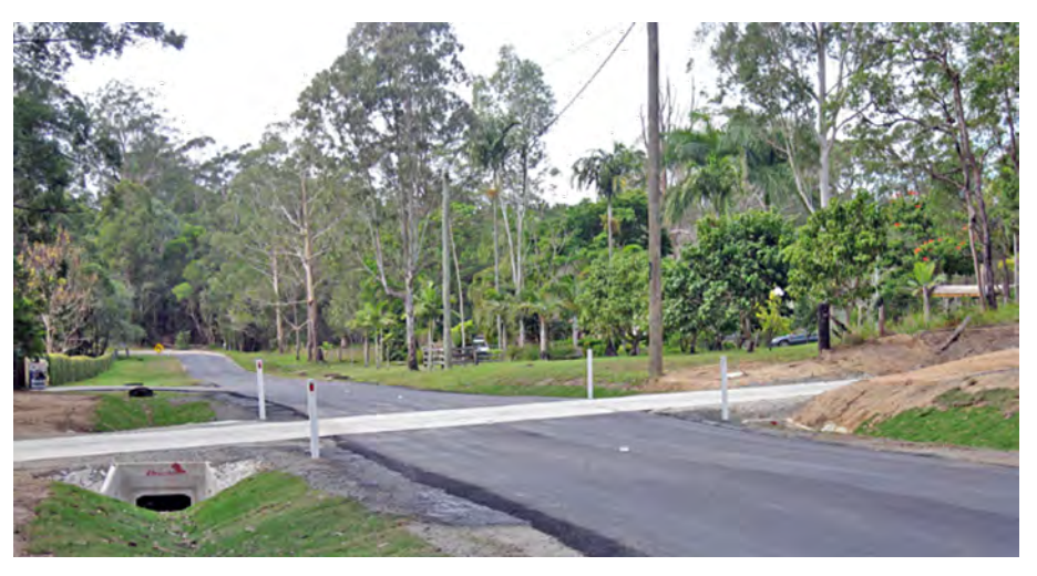
Peterson Road level crossing completed and road reopened, 9 June 2012.