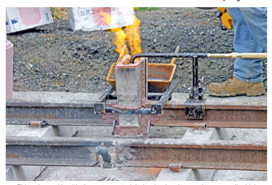
Firing the weld, with the extra material clearly showing on the near rail which must be removed as part of the finishing process.