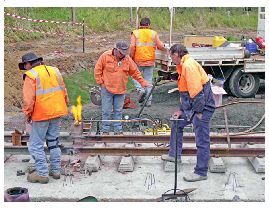
Using the gas burner to preheat the rail ends.

The basic alumino-thermic process still forms the heart of these welding processes.