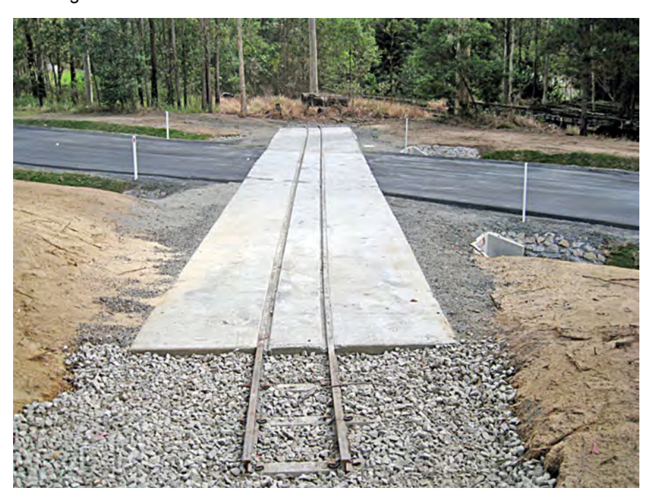
Peterson Road level crossing completed and road reopened, 9 June 2012.

The highlight of the last couple of months has been the installation of a level crossing over Peterson Road.