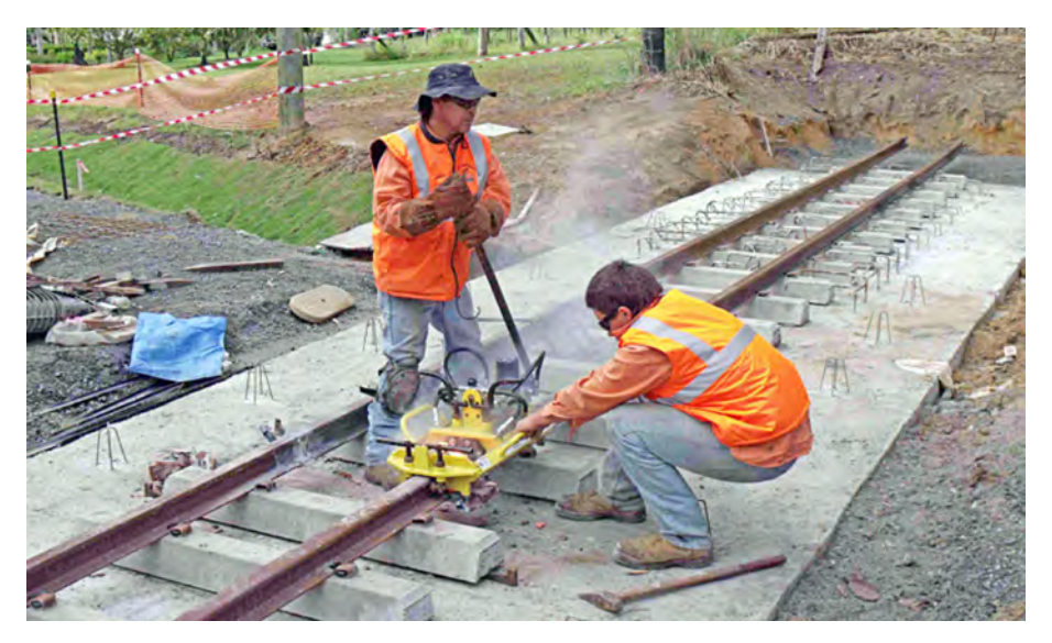
Using the hydraulic shears to remove the excess metal from the weld before it completely cools.