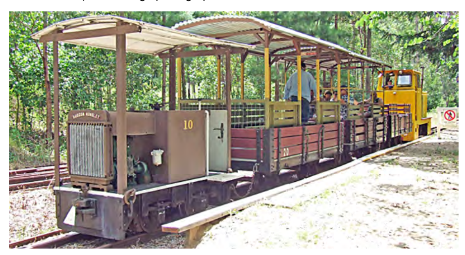
The Hudson Hunslet, two covered four wheel wagons, Grovers bogie wagon and the Gemco at Storey Brook station, 26 January 2011.