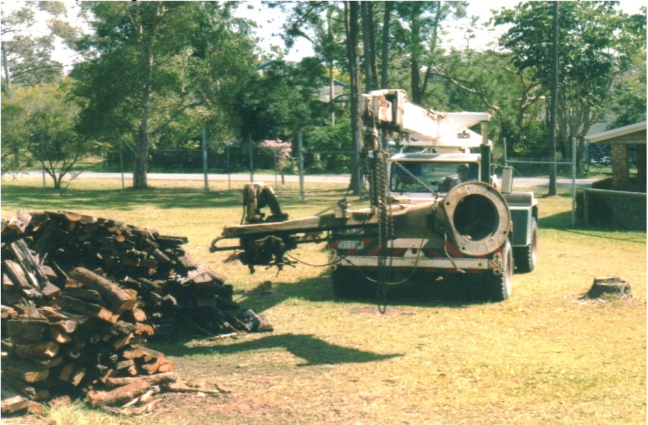
Stored for many years with Graham Chapman, the Societies radial arm drill is manoeuvred around to be placed in the workshop for storage, October 2006.