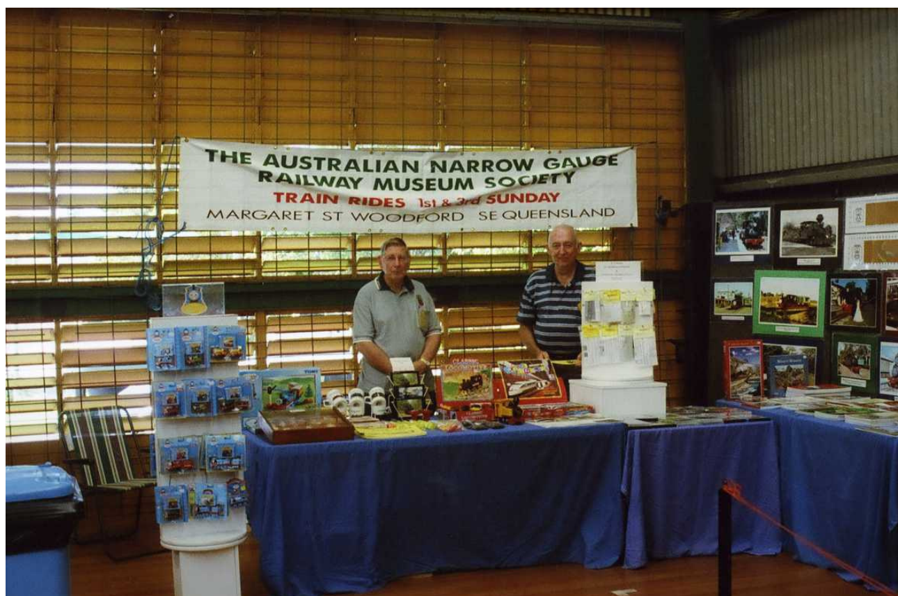
ANGRMS stand at the March 2008 Sandgate PCYC Show.