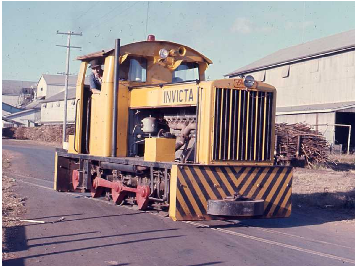
Bingera Mill's ComEng Invicta makes her way through the mill yard light engine, 26 th August 1969.