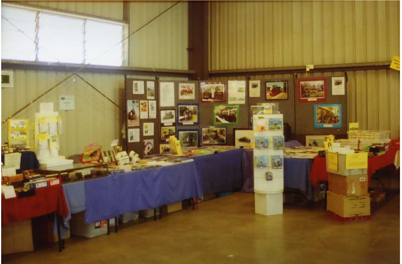
ANGRMS stand at the June 2008 Toowoomba Model Railway Show.