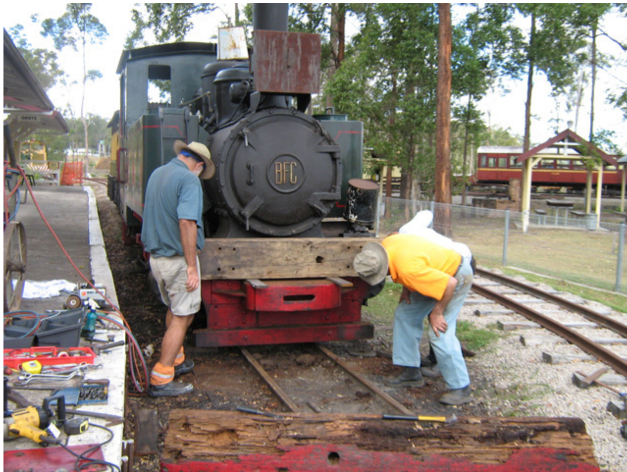
New buffer beam being temporarily fitted to Pleystowe No. 5 to check alignment of bolt holes. In the foreground is the original buffer beam showing the extensive termite damage.