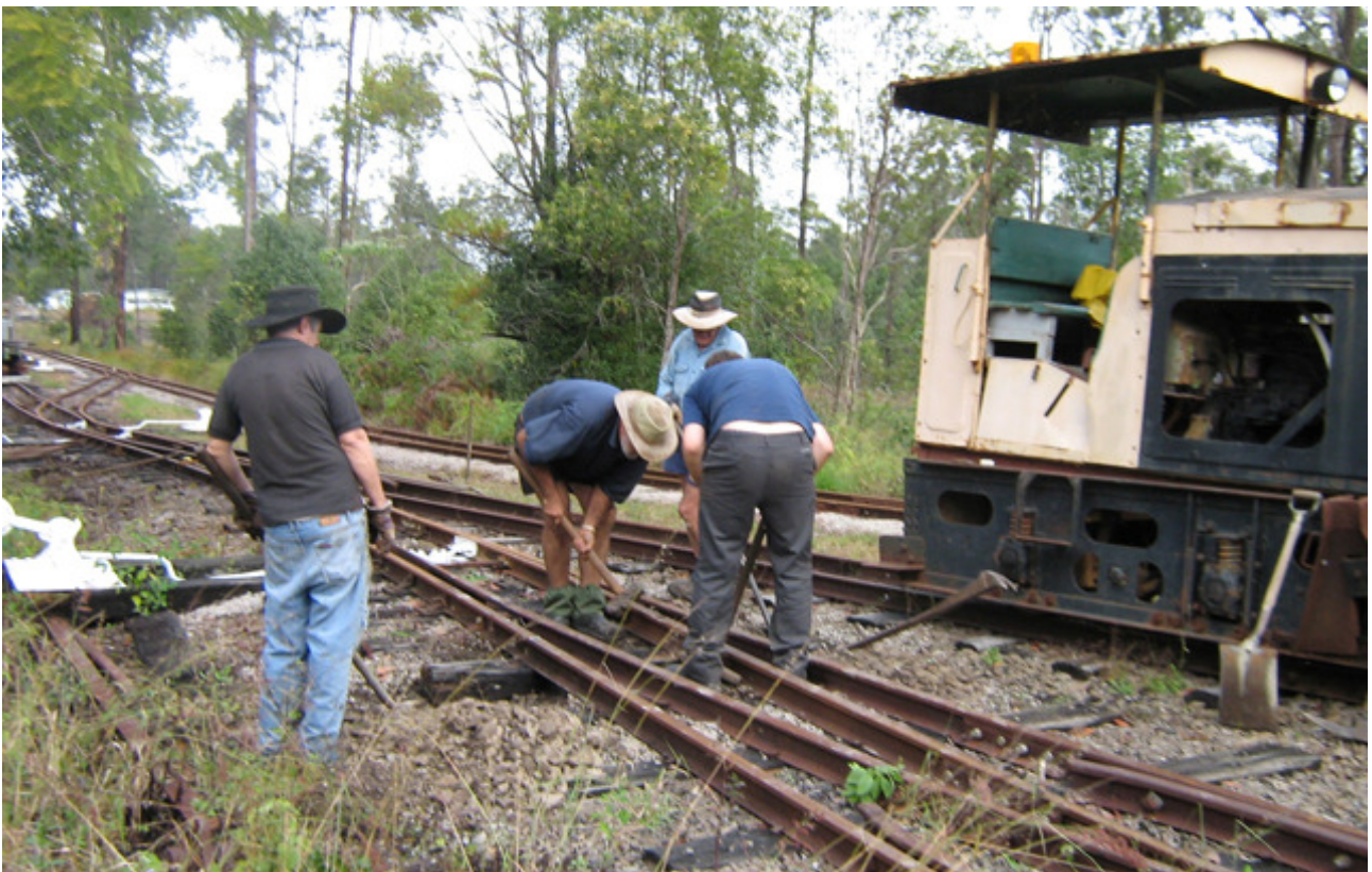
Sleeper renewal underway on the pointwork leading to the siding to the workshop.

It is an ambitious target, but one I'm sure we can meet with the same dedication and commitment shown to the Woodford Station project.