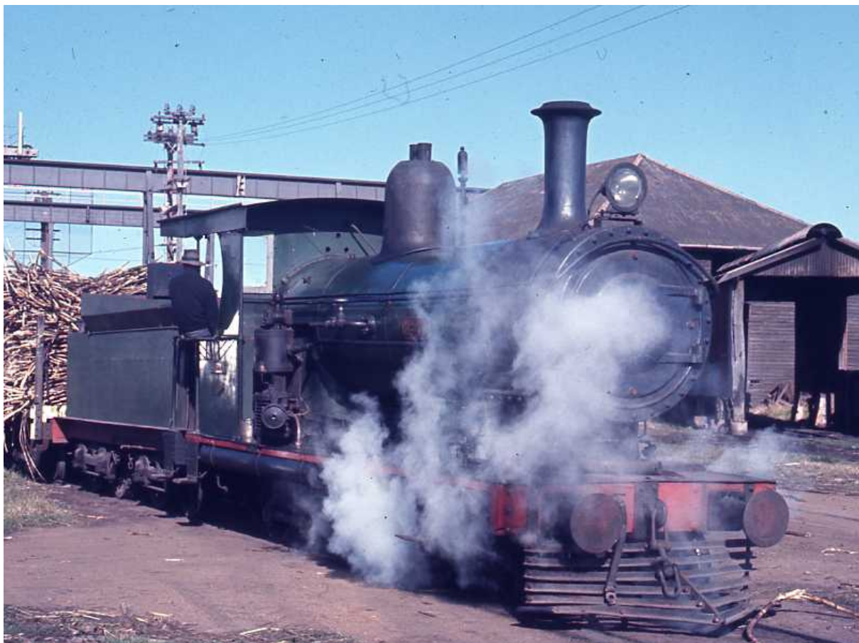
Bingera Mill's ex-QGR B13 Number 48 clouds herself in steam whilst pushing back during shunting manoeuvres on the 3'6" gauge in the mill yard, August 1968.