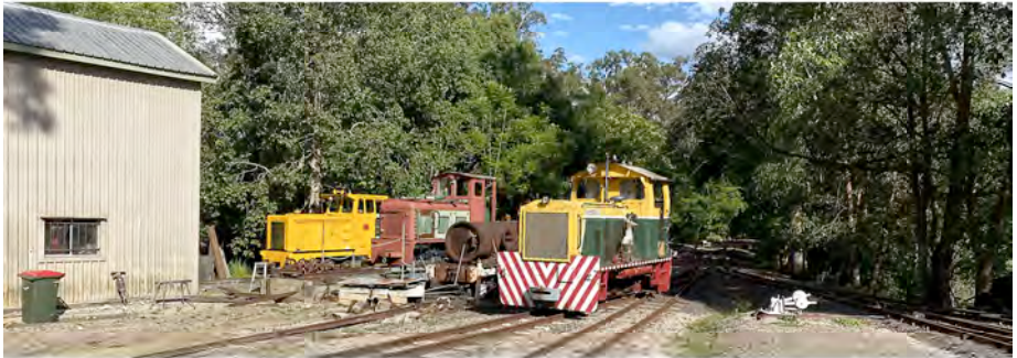
The line up of locos which were taken to the Café on the night of Friday 10 December with lights attached for the night event.