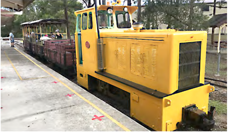
Gemco's first post-overhaul passenger run, Christmas Get Together, 11 December 2021.

weekend. This is our major show for the year so please reserve it in your diary. We will also be setting up on the Friday.