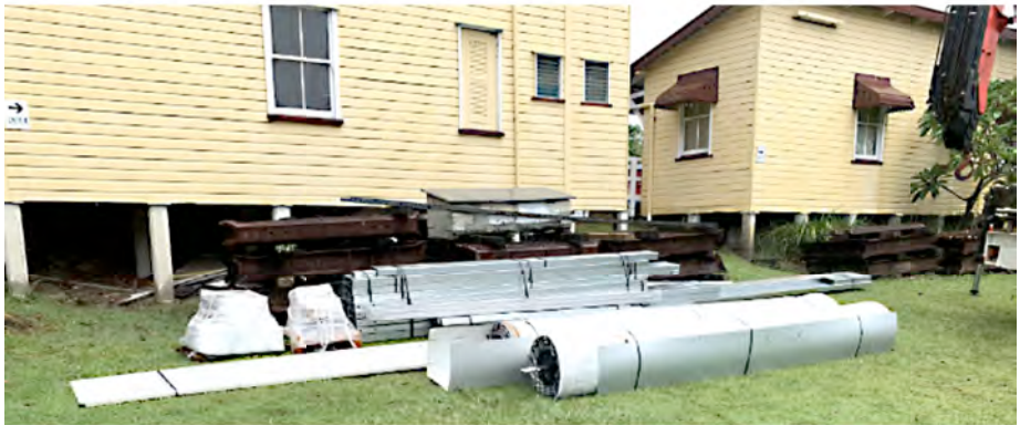
Workshop annex kit, 24 February 2022.