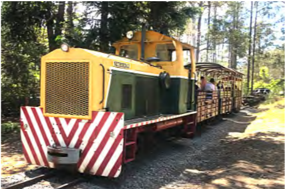
First passenger train over 100% steel/concrete sleepers, 3 December 2023.

Running Days: 1st and 3rd Sundays Trackwork Saturdays: Saturday before the second running day of the month Work Days: Every Saturday as required