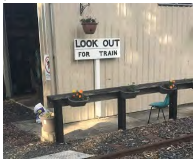
Newly installed Look Out for Train sign, Saturday 19 April 2025.