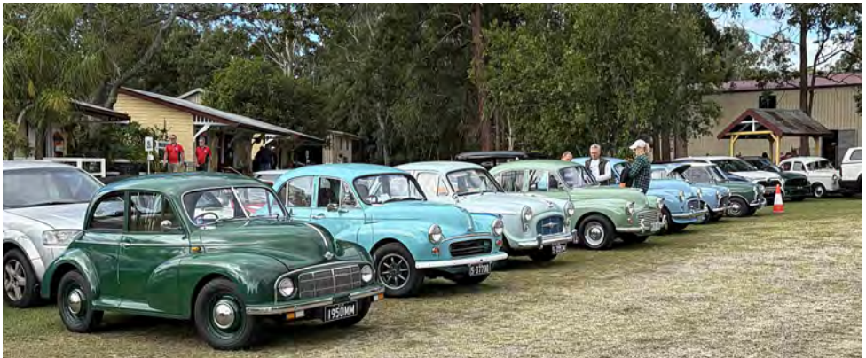
Mini Morris Car Club Visit 7 June 2026.

Tully Mill celebrated its centenary in 2025. We now have a supply of the original Tully Mill book " By the Banyan – Tully Sugar – The First 75 Years " and the second book " Beyond the Banyan – Tully Sugar – 2000 – 2025 " which covers the last 25 years. Price: $55 each plus postage if required.