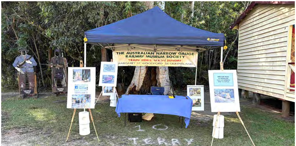
ANGRMS Display, Caboolture Historical Village Heritage Day, 30 May 2026.

Running Days: 1st and 3rd Sundays Trackwork: Saturday before 3rd Sunday Work Days: Every Saturday as required Rolling Stock/Mechanical Work Day: last Sunday